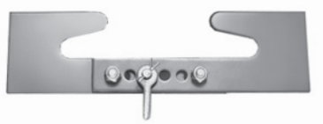
Beam Clamp 015-798