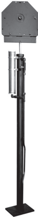
Hydraulic Dashpot 016-410L