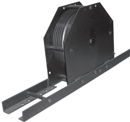
Upright Head Block 1CS-81255R